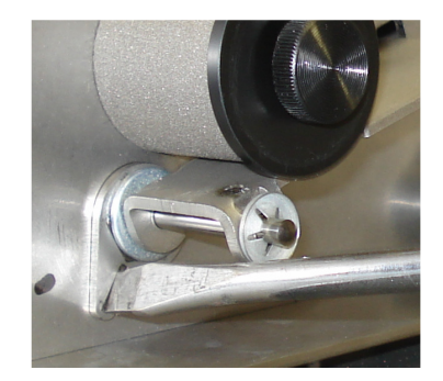
Fig 6 Screwdriver control